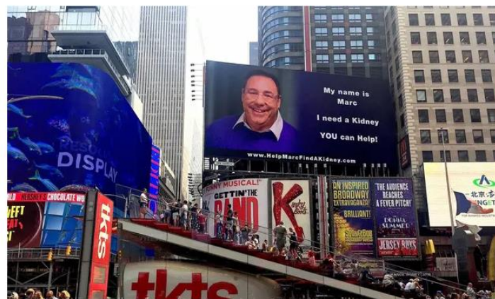
There are more than 253.8 million adults in the nation - most of whom presumably have a kidney to spare.