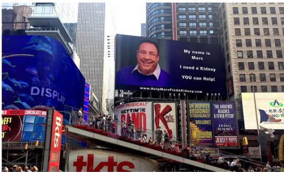
There are more than 253.8 million adults in the nation - most of whom presumably have a kidney to spare.